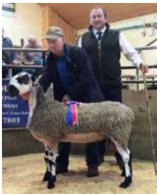
2016 CHAMPION BLUE FACED LEICESTER - £2700 Ram Lamb from Messrs Lord.