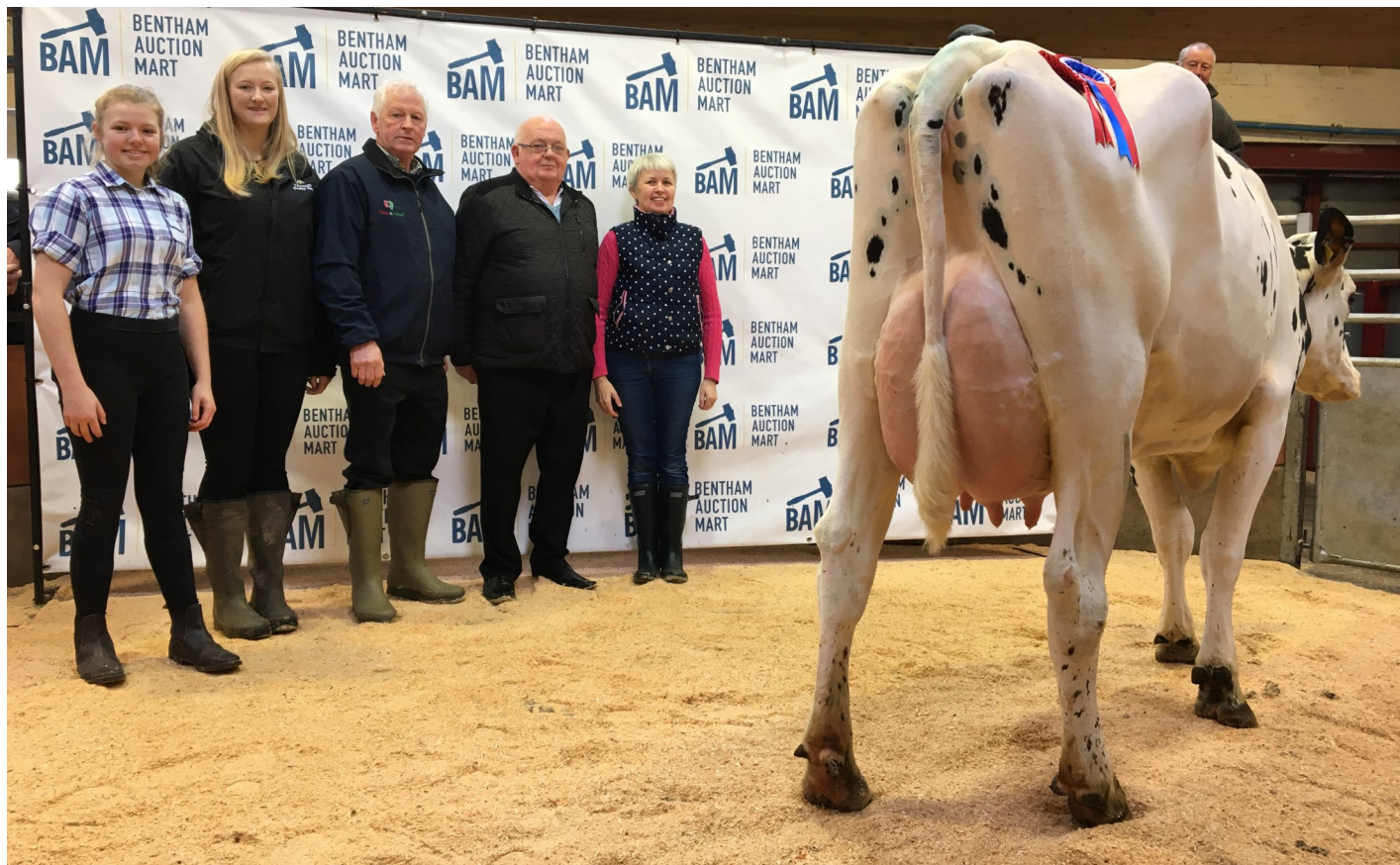
Champion Christmas Dairy from Booth Brothers realising £2400