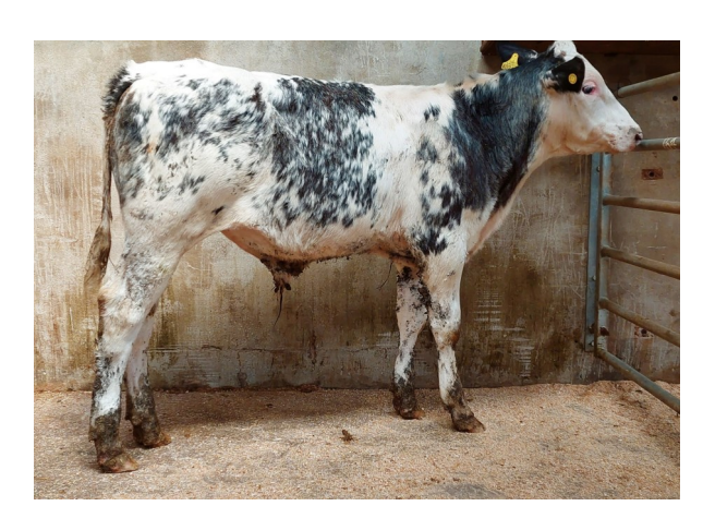
BRB Bull £540 from J A Salthouse & Son

An entry of mainly stronger calves, Bulls selling at recent high rates, Angus' to £490 from TD & V Whitaker, with others to £485 & £470 from JM& AE Wallbank, Wray, the 6 strongest all over £455. JA Salthouse & Sons topped the day with their 4month Blue bull at £540, younger types to £475 & £470 from H&A Stephenson and D&D Hodgson respectively. Younger types all late £300's. Heifers with style good to sell, the best again from the Salthouse's with a Blue bull at £410. Angus' not as sharp as the previous week but nicely top side of £200. A few nice suckler bred Limousins to £470 & £460 from NM Breaks. Dairy bulls to a high of £320 from JT&AG Moran with their Fleckvieh. B&W bulls in demand, 7 ranging from £170-£250 all either side of 8 weeks, the strongest to £330. 4-6week nice types £100-£130 with a few smalls regularly £80-£90.