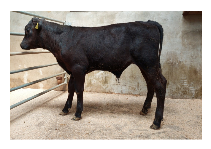
AA Bull £490 from TD&V Whitaker