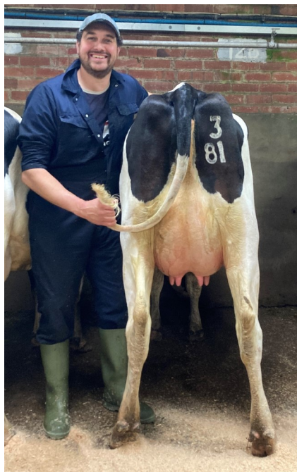
D & A Blacoe NCH £2280