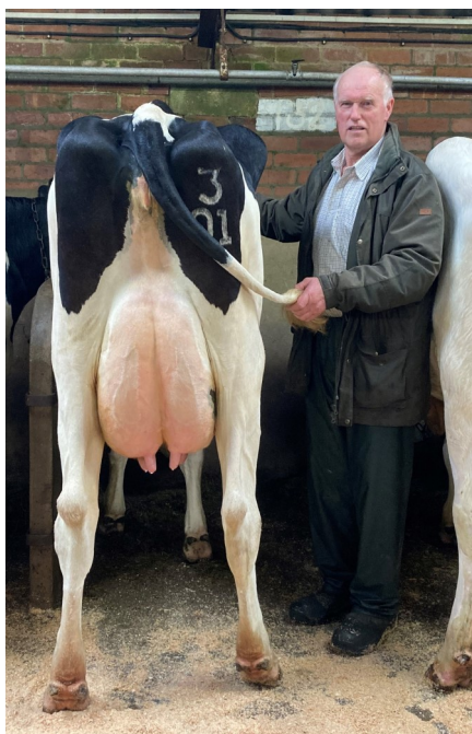
GW Whitwell NCC £2100