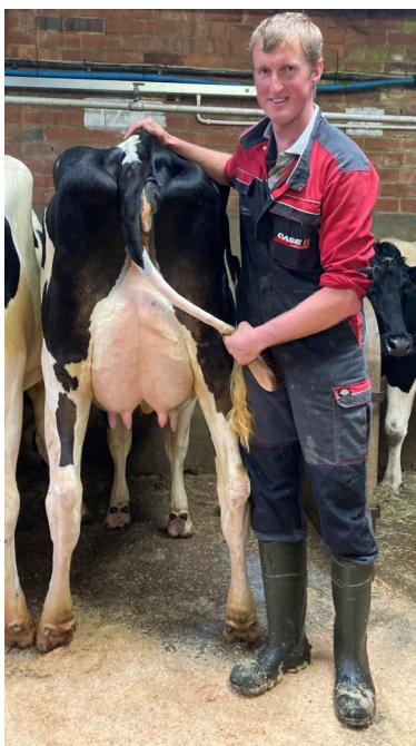
PD & BS Lawrence NCH £2180