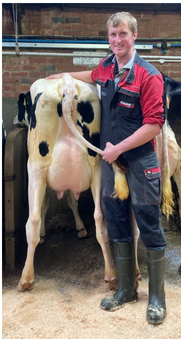
PD & BS Lawrence NCH £2250