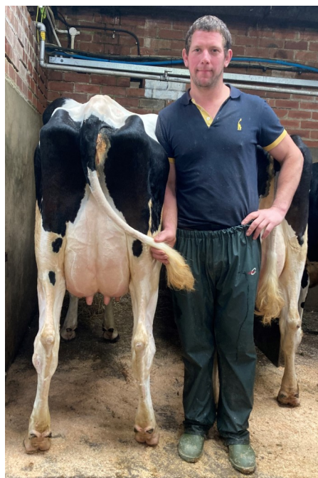
PW & DM Swindlehurst NCC £2000